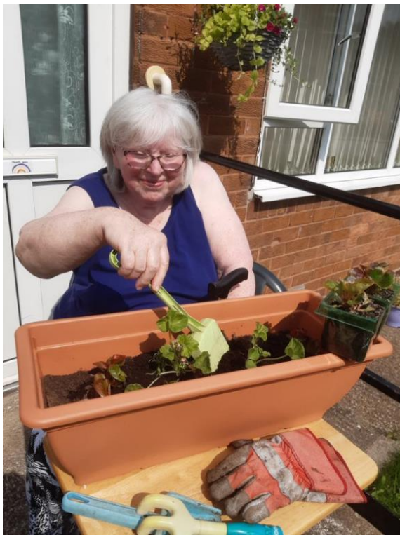
Enjoying the Gardening Activity