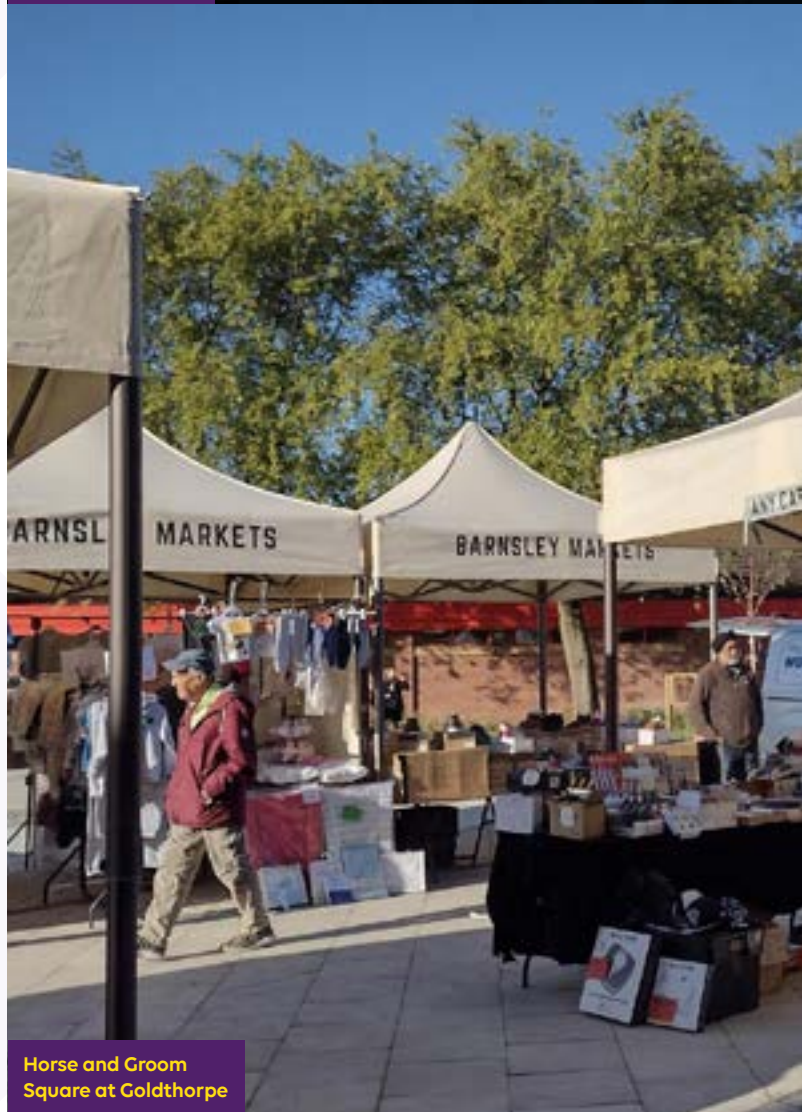
Horse and Groom Square at Goldthorpe