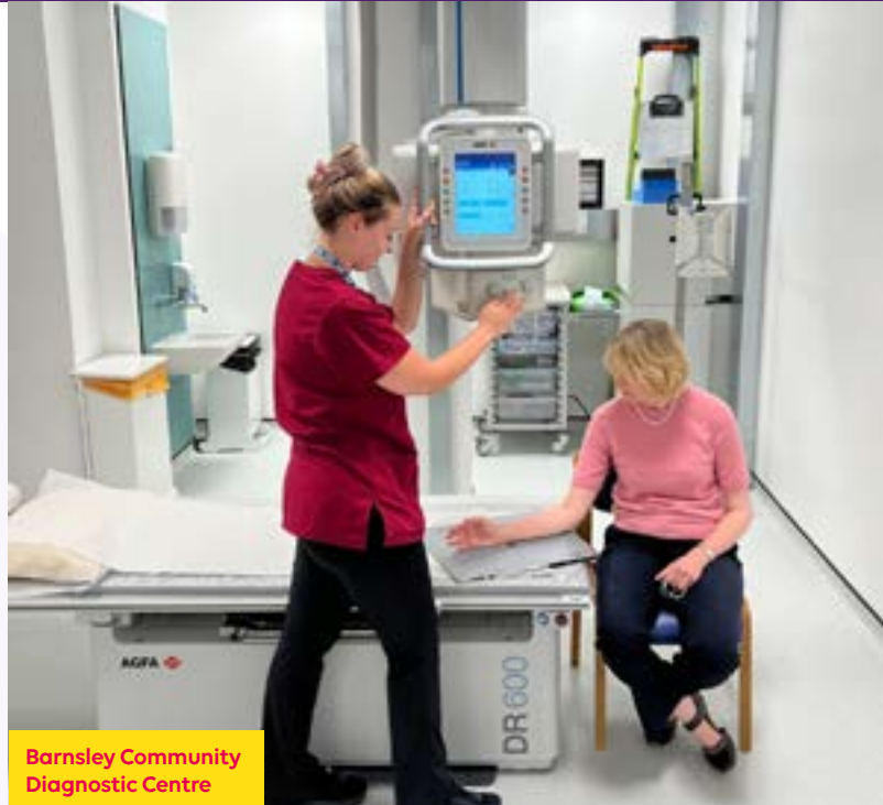
Barnsley Community Diagnostic Centre

We'll continue in collaboration with our partners to implement local public health initiatives across the borough to tackle local health inequalities, like our How's Thi Ticker and our involvement in the Yorkshire Smokefree Barnsley campaign.