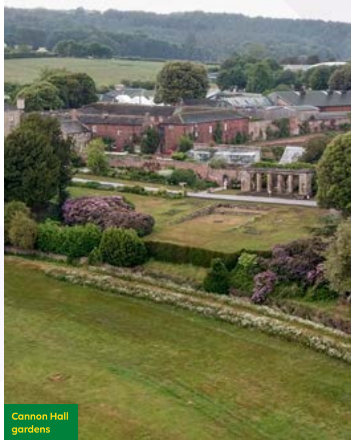
Cannon Hall gardens

We believe that everyone should be supported to have warm homes, this is supported by our commitment to maintaining our decent homes standard where 100% of homes must be safe and welcoming. We want to help organisations work together to make sure our residents are living in warm, healthy, energy-efficient homes. We'll continue with the implementation of our Affordable Warmth initiatives bringing together partner organisations across the borough together to share knowledge, expertise and resources on tackling the health inequalities caused by fuel poverty.