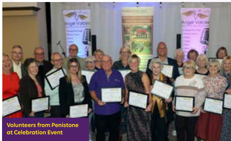
Volunteers from Penistone at Celebration Event