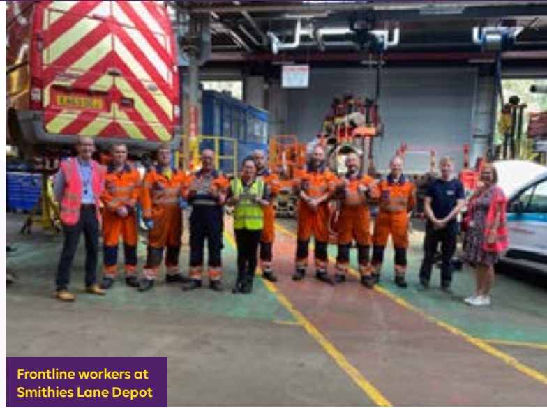
Frontline workers at Smithies Lane Depot

We have a strong set of Core services supporting the council to be effective, productive and to deliver best value in our services. We have the right governance and assurance in place to keep the council safe. At a time of financial uncertainty this is an incredible achievement and one we hope you are as proud of as we are.