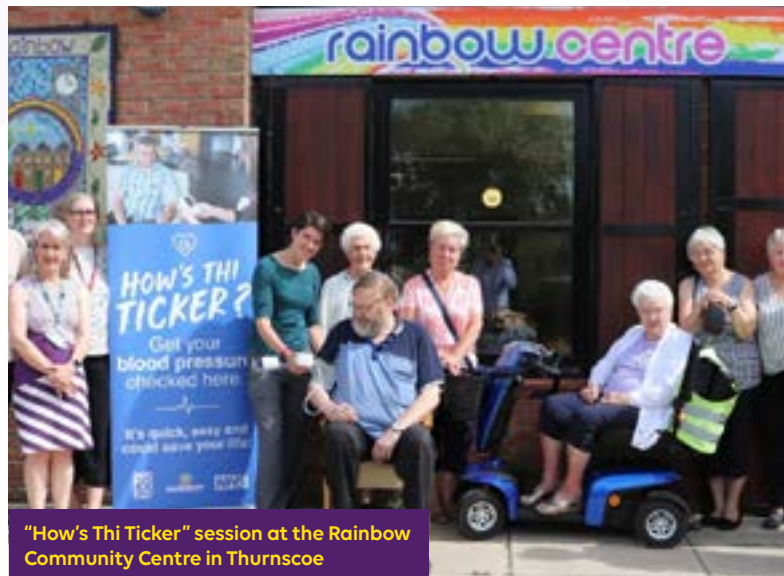
"How's Thi Ticker" session at the Rainbow Community Centre in Thurnscoe