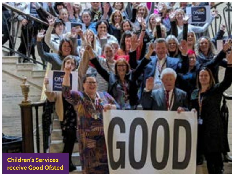
Children's Services receive Good Ofsted