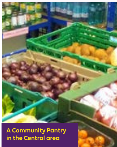
A Community Pantry in the Central area