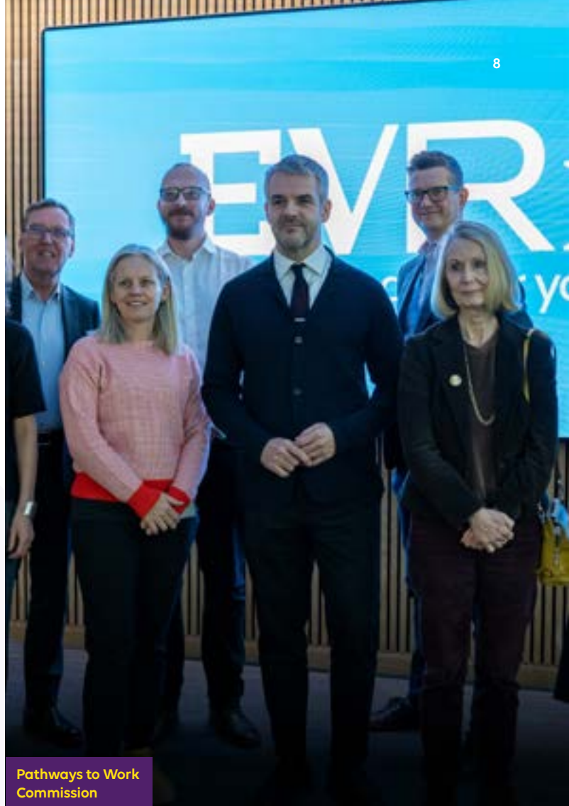
Pathways to Work Commission

You can read more on our 'How we measure performance' web page .