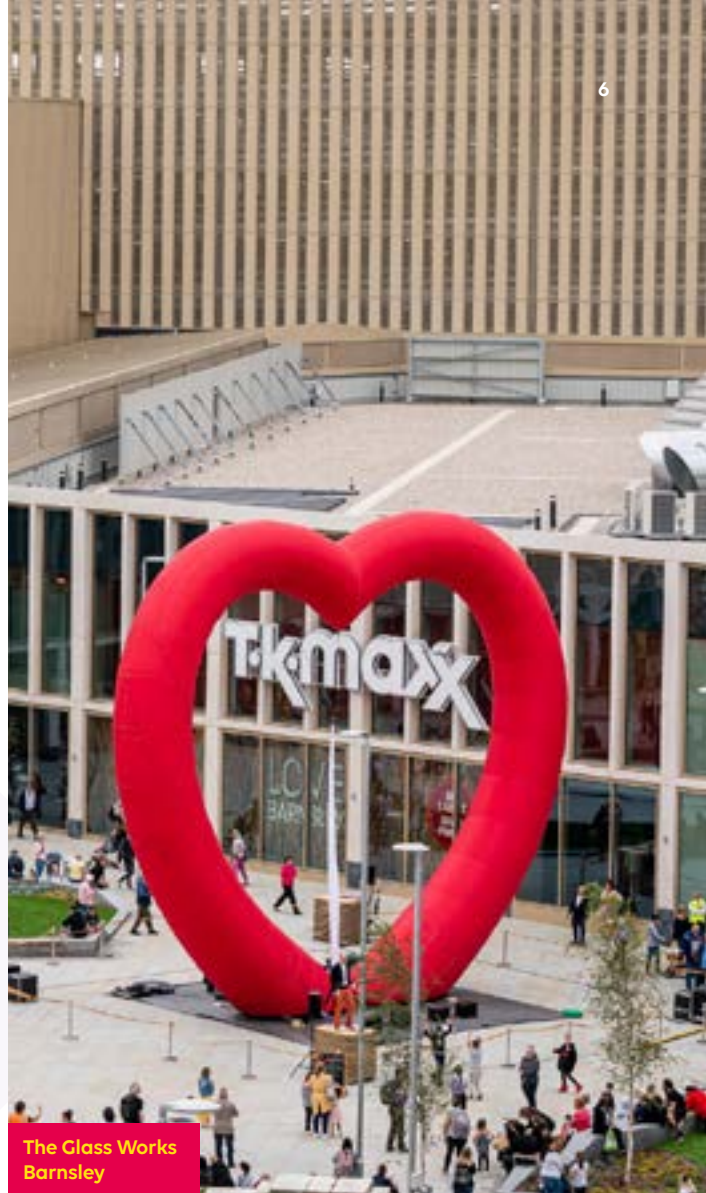
The Glass Works Barnsley

We want to prepare young people and people not in employment for rewarding and sustainable work via our Pathways to Work programme . It's an ambitious plan that aims to level the playing field by understanding the challenges that people face when getting into work.