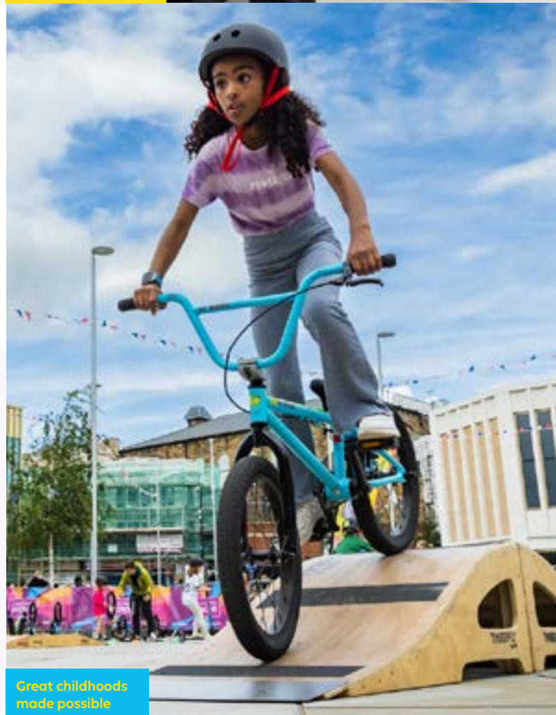
Great childhoods made possible

The development of the Barnsley Youth Zone will provide a safe and aspirational place for young people. Hosting first class facilities in sports, arts, performance and enterprise. Skilled youth workers will offer over 20 different activities to try and will support young people to realise their own aims and achievements. Located in an exciting new building close to the train station and bus interchange it will be accessible to young people across the borough.